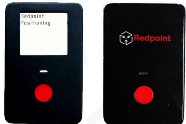
Personnel Badge Front (Right: Screened, Left: Screenless)

A call button lets the user acknowledge alarms, check status, or call for help.