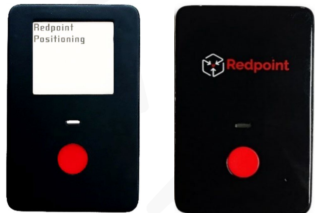
Personnel Badge Front (Right: Screened, Left: Screenless)

A call button lets the user acknowledge alarms, check status, or call for help.