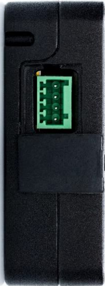
Side view with sensor interface port